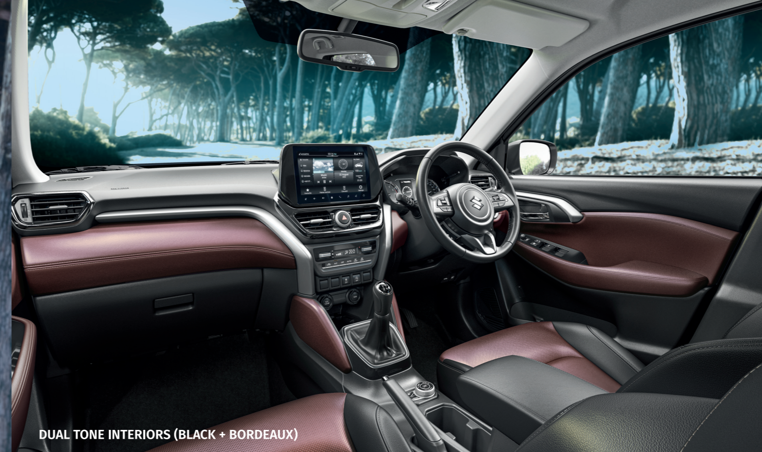
DUAL TONE INTERIORS (BLACK + BORDEAUX)