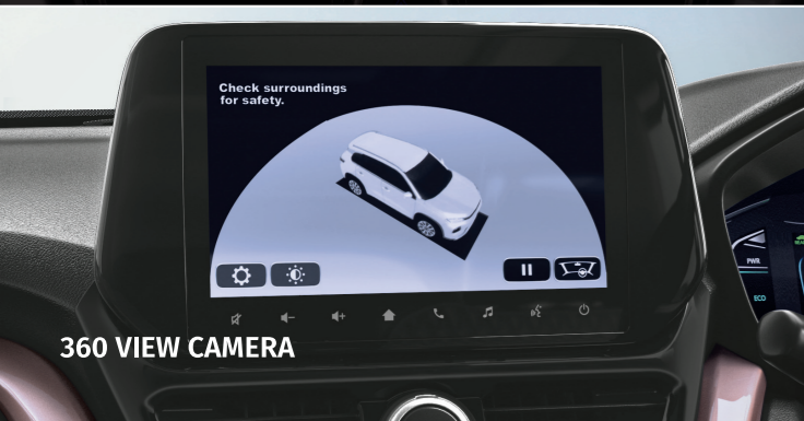
360 VIEW CAMERA