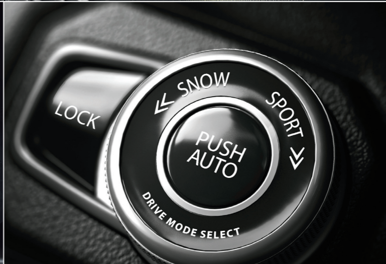
DRIVE MODE SELECTOR