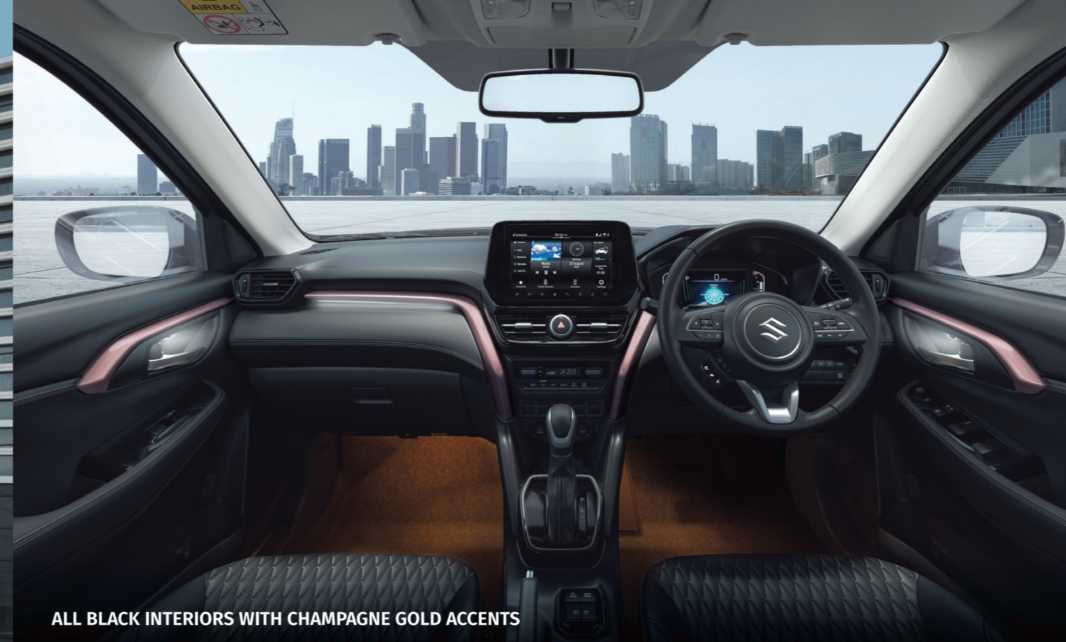
ALL BLACK INTERIORS WITH CHAMPAGNE GOLD ACCENTS