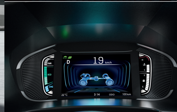
DIGITAL INSTRUMENT CLUSTER