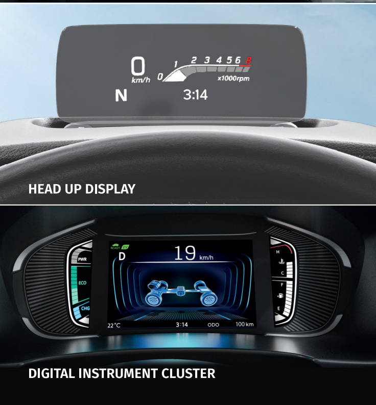
HEAD UP DISPLAY

The Smartplay Pro+ with a 22.86 cm touchscreen display comes with an intuitive user interface and an Advanced Voice Assist for a seamless driving experience. Enjoy an enhanced sound experience with the Premium Sound System by Clarion®. You can also connect your smartphones to your car with the Android Auto® 5 and Apple CarPlay® 6 for a truly wireless experience.